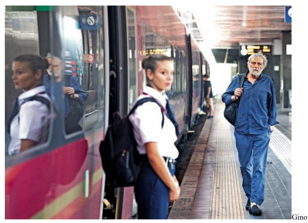
Strada at the station in Milan